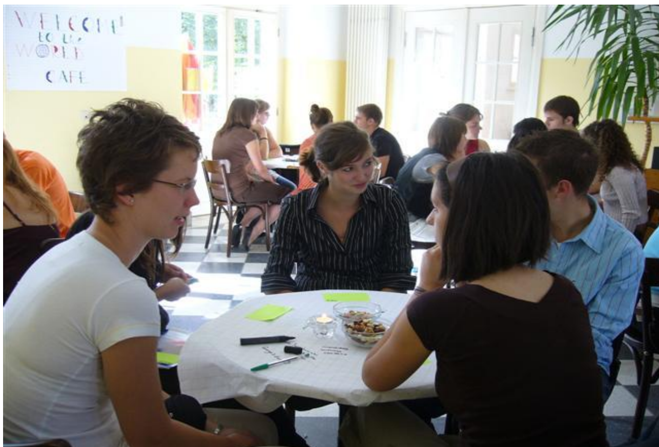
Example of a World Café style of communicating and discussing

On Wednesday 4th December 2013, the Trust held its third Patient Power event at St Helens Hospital. These events are extremely well attended and patients were given feedback from the last event regarding progress made against their concerns and comments. This time, the patients and their representatives engaged using a "World Cafe" style approach. World Cafe is a participative process which enables people to have creative conversations while sitting cafe-style around small tables. Paper table cloths are often used so that the ideas and issues which emerge from the conversations can be recorded. After about 20-30 minutes, people move to a new table and the conversations continues. One member of the initial group will remain at the table to host the new conversation and help to build links between the different strands. Many ideas and issues were identified and these will be addressed with the most appropriate people. Feedback will again be provided at the next event. Compliments and suggestions are also received frequently - these are shared with the Executive team and the specific area the compliment / suggestion refers to.